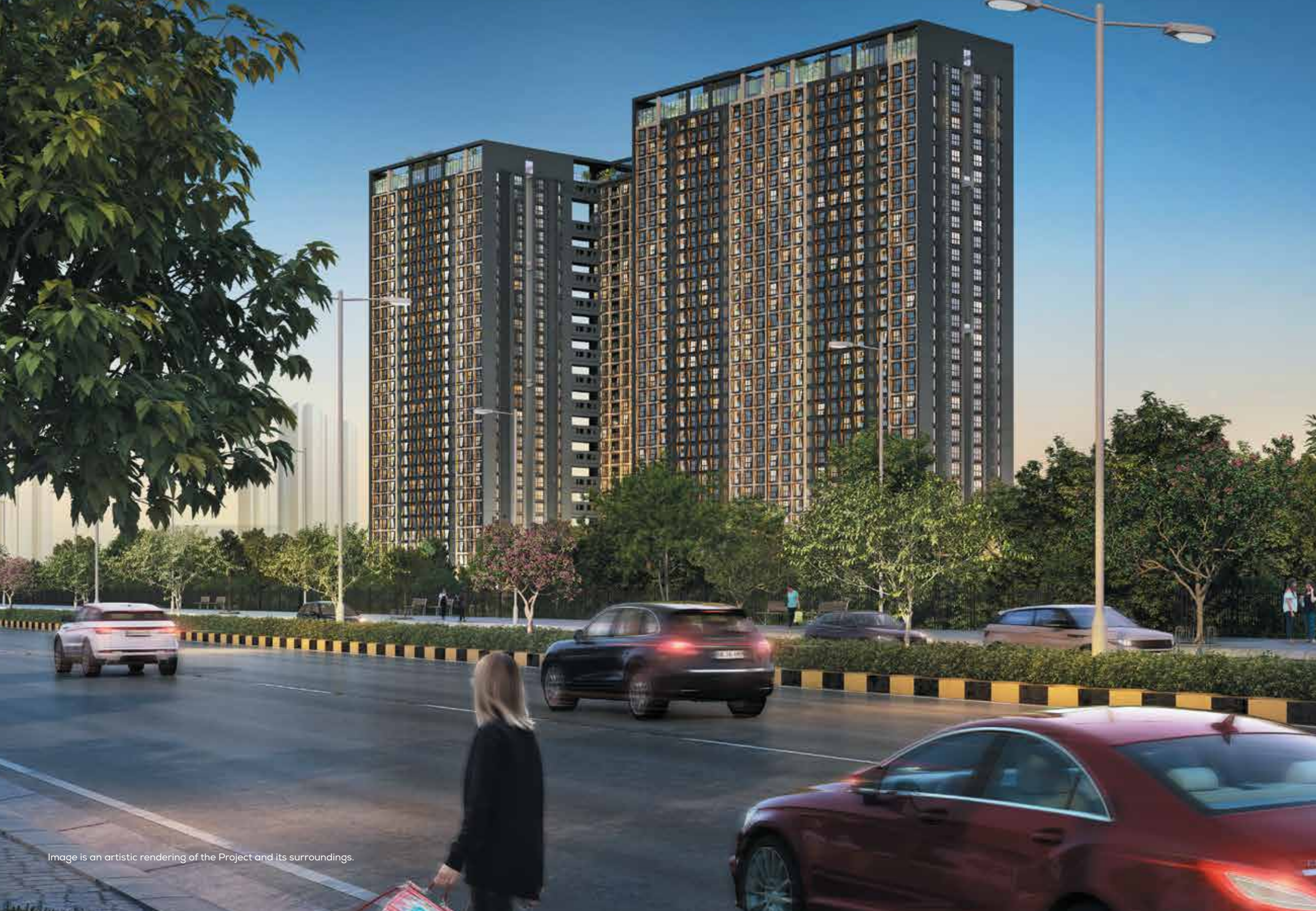
Image is an artistic rendering of the Project and its surroundings.